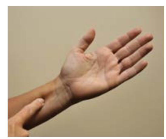
Step 1: Find the point, three finger widths from base of wrist.

Step 2: Now feel the center of the two tendons with the index finger. Apply pressure with your pointer finger. It is common to feel a dull aching sensation at the point. Stimulate this point with moderate to firm pressure with your fingertips in a circular motion and repeat the movement on each wrist for at least 30 seconds and up to 2 minutes. The treatment can be used as often as needed. Once you know the location of the point, some people find it is easier to use their thumb to apply the pressure.